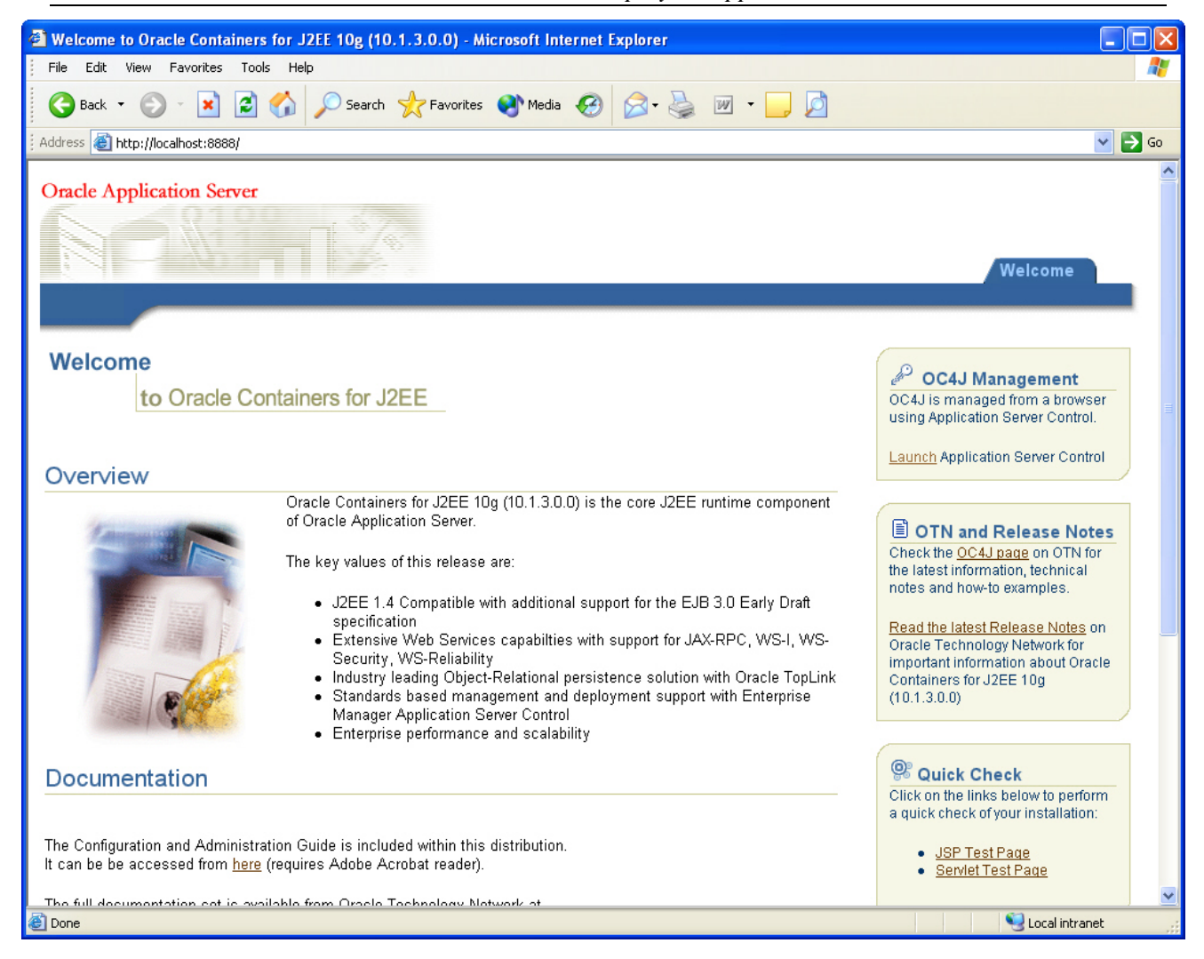
Figure 1. Standalone OC4J Server home page

9. Open another the command line window and change to the directory "C:\JDev1013\jdev\bin." Enter this command to stop the server: